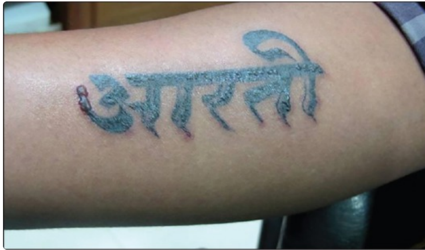
Blistering following Q switched Nd YAG laser