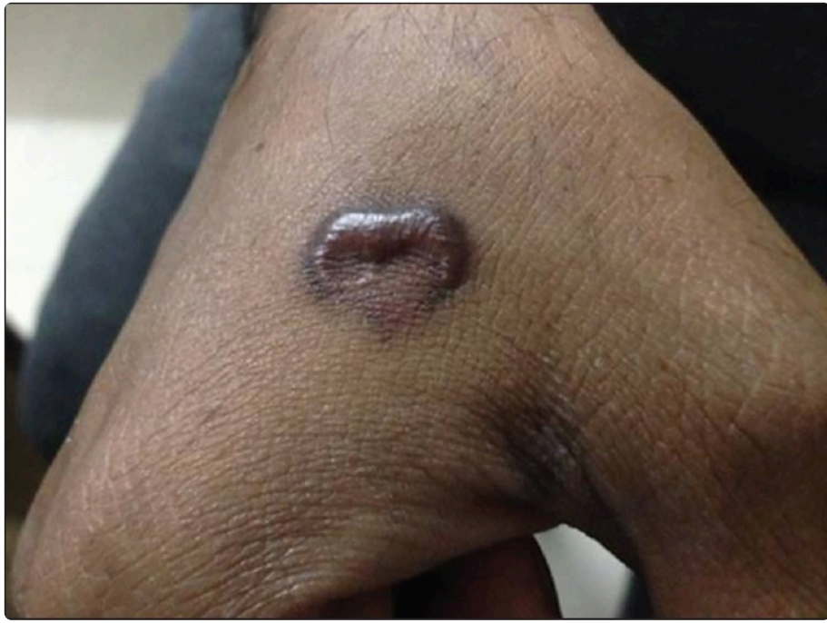
Hypertrophic scarring following Q switched Nd YAG laser 1064nm