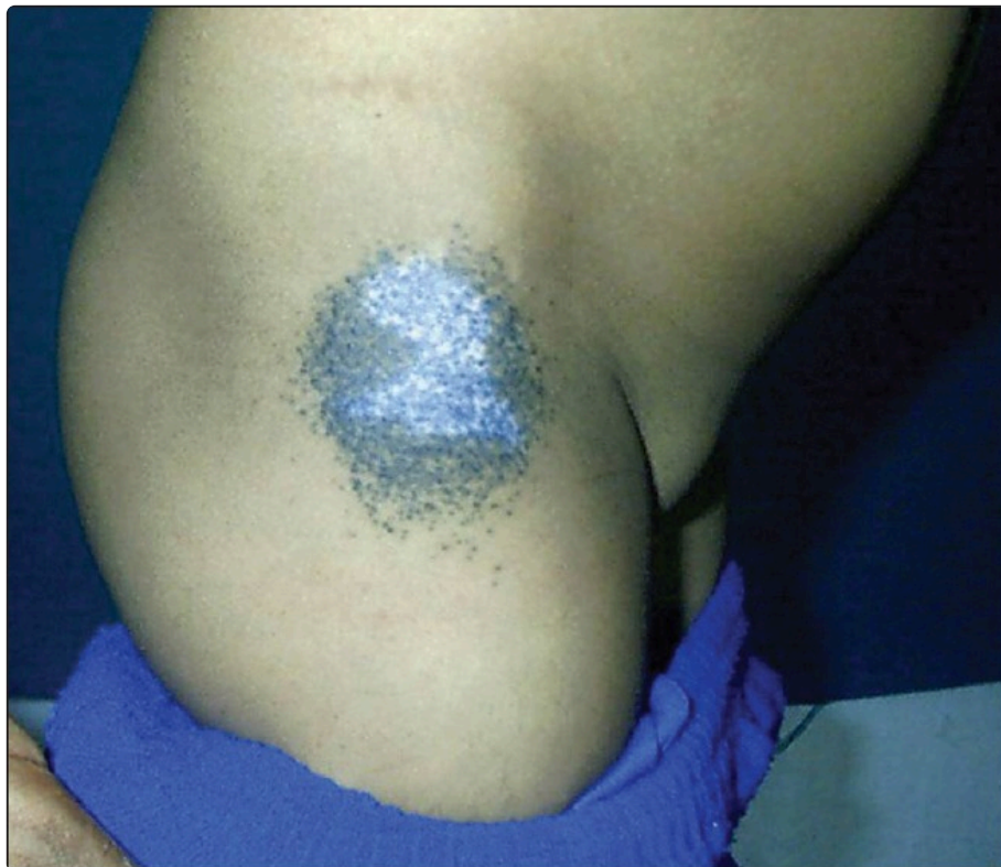
Fading of the tattoo and bluish discoloration due to Tyndall effect on a patch of vitiligo