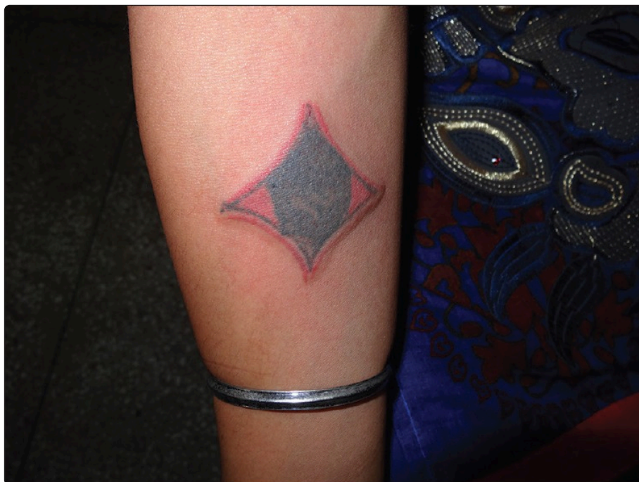
Photoallergic reaction in a red tattoo