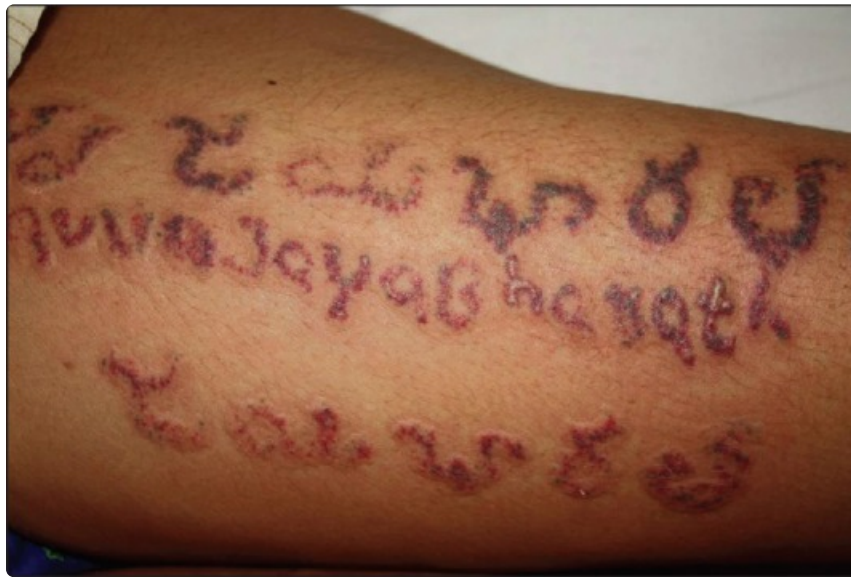
Purpura and bruising following Q switched Nd YAG laser 1064nm