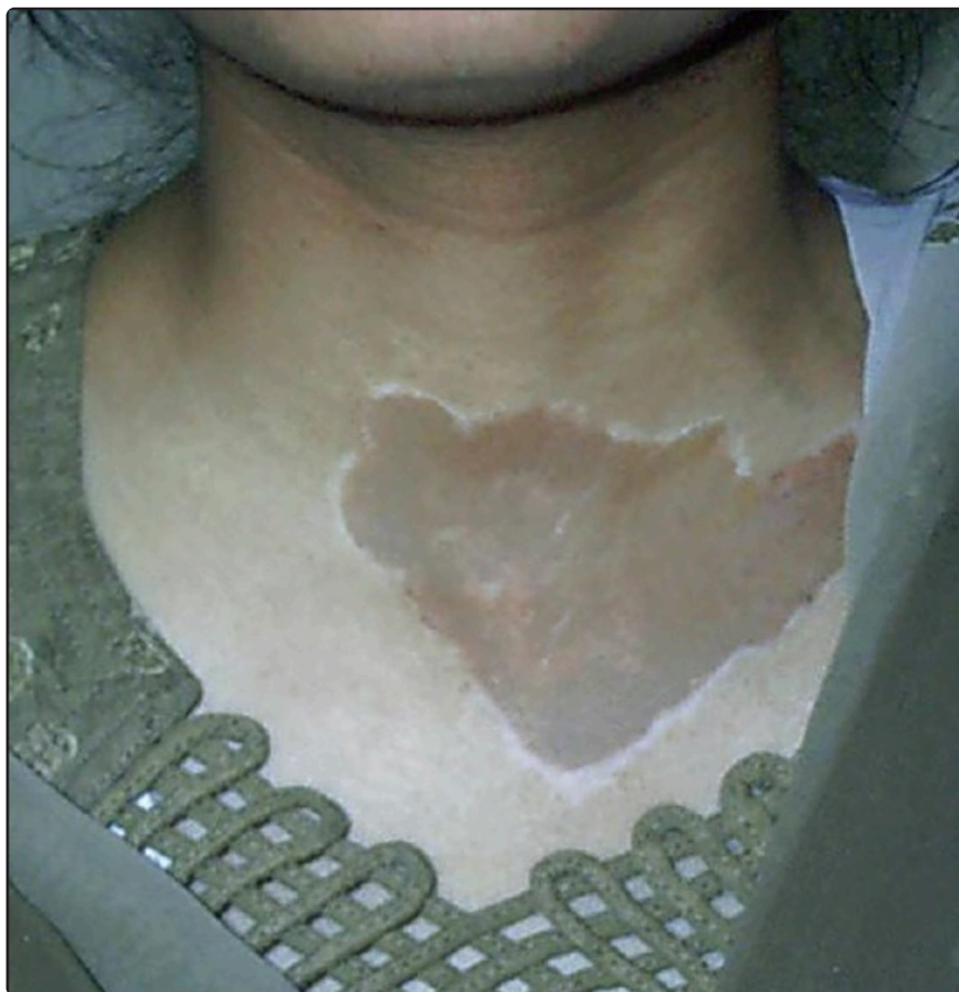
Colour mismatch of a skin-coloured tattoo on the exposed area used as a camouflage technique for vitiligo